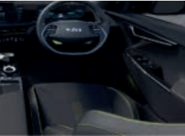
Black Suede with Neon Green Stitching