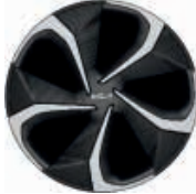
20" Alloy Wheels - Black