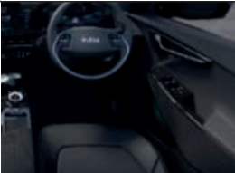
Black Vegan Leather