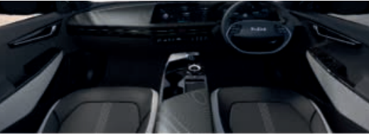
Black Suede and White Vegan Leather