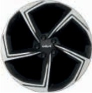
21" Alloy Wheels

Images and colours shown are for illustrative purposes only and may not be to UK specification. All information and illustrations are based on data available at the time of print (October 2021) and are subject to change without notice. Contact your local Kia dealer for current information.