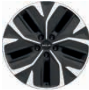
19" Alloy Wheels - Black