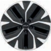
19" Alloy Wheels - Grey